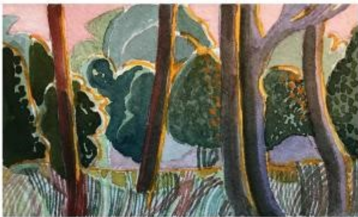
Evening Light, Watercolour

Bournemouth ARTS CLUB Southern Contemporaries